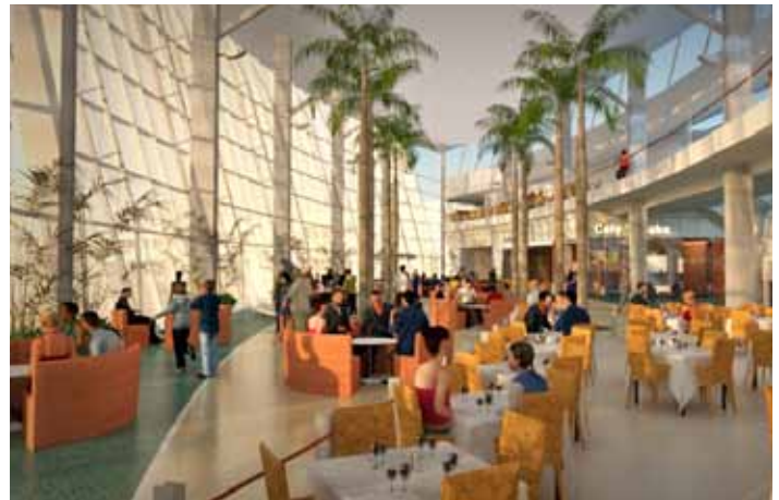
Rendering of the expanded concessions core in Terminal 2